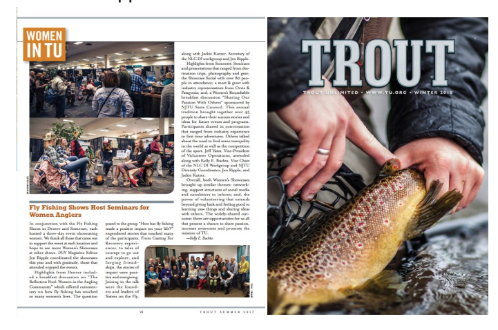
Look for an additional article on those results in the current Winter 2018 issue. Also new articles featuring the Diversity Initiative in the Spring 2018 issue.

Look for DI articles in TROUT magazine. In addition to the survey results being reported at the Regional Rendezvouses, they also appeared in the Summer 2017 TROUT.