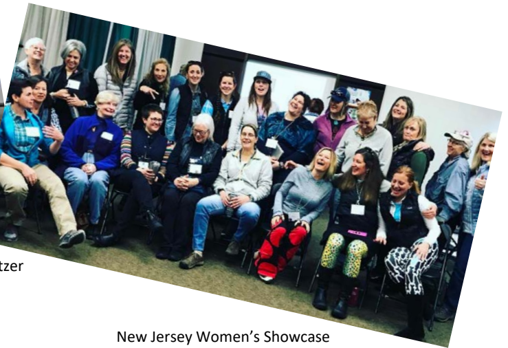
New Jersey Women's Showcase