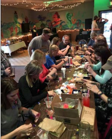
The Seedskaadee TU chapter in Green River, WY held an Iron Fly- almost half of the attendees were women and a gal won it!