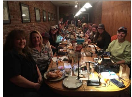
First event of the Washington TU Women's Weekend was a huge success! The fun continued with a Women's Level One Fishing Class and a Costa Slam Film Night.