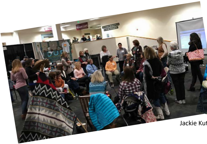
Denver Women's Showcase