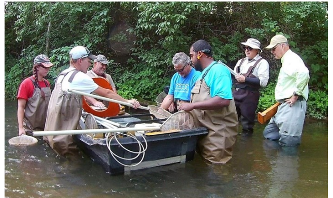
A stream survey with the Wisconsin DNR and Kiap-TU-Wish volunteers.