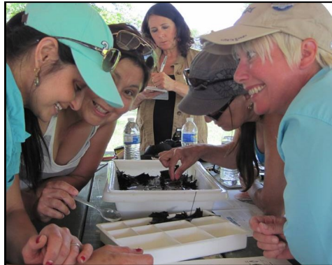
Women's Intro to Fly Fishing, in State College, PA

port from the Workgroup including access to experienced women in this role, as well as other operational re-