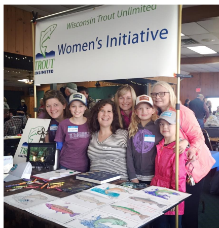
Wisconsin Women's Initiative out in full force at Central Wisconsin TU Troutfest!

and communications to women, and for women's leadership development. The State Coordinator promotes the appointment of WI Chapter Coordinators and provides support and networking among WI Chapter Coordinators in the state. The State Coordinator will also work with chapters to modify current programs/meetings to provide more meaningful engagement opportunities for women members and to assist with creating new programs deemed necessary in fulfilling the Coordinators' roles. Each State Coordinator is en-