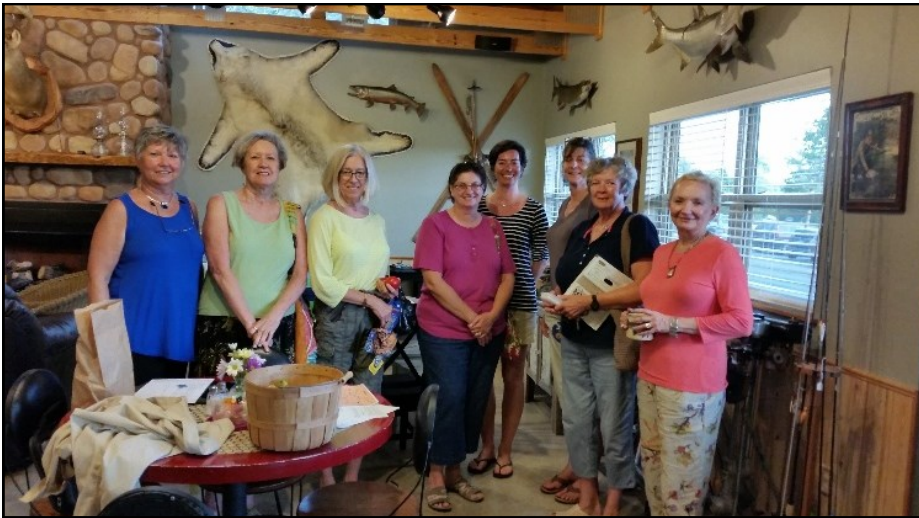
The "Trout Chicks" are bringing fishing and fun to women in Arkansas