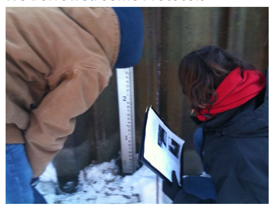
We Borrowed Some Protocols