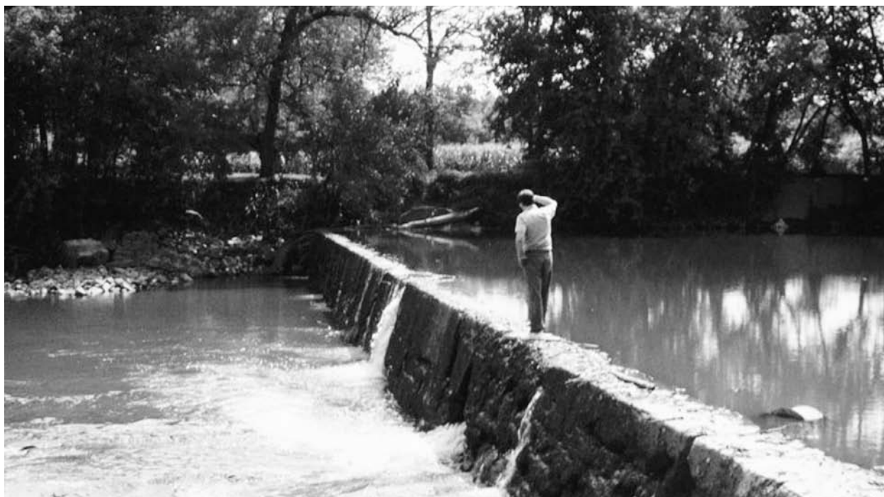
Detters Mill Dam on Conewago Creek in Pennsylvania.

rebuilding an old structure to bring it up to today's safety standards can be expensive, sometimes prohibitively so, particularly if the owner is an individual or small community. In some cases, the most efficient and cost-effective way to eliminate the safety hazard is to remove the dam.