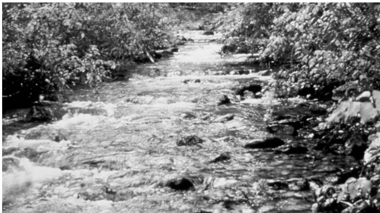
Example of suitable fish habitat.