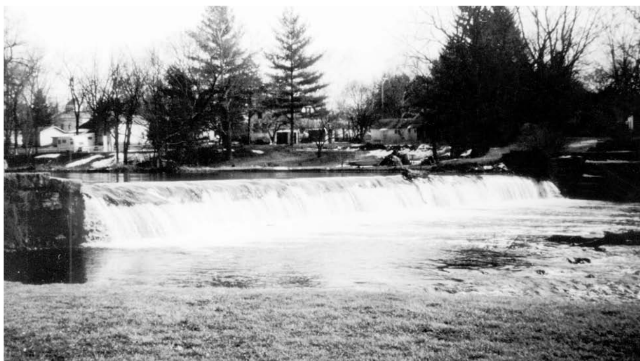
Shopiere Dam on Turtle Creek in Wisconsin.