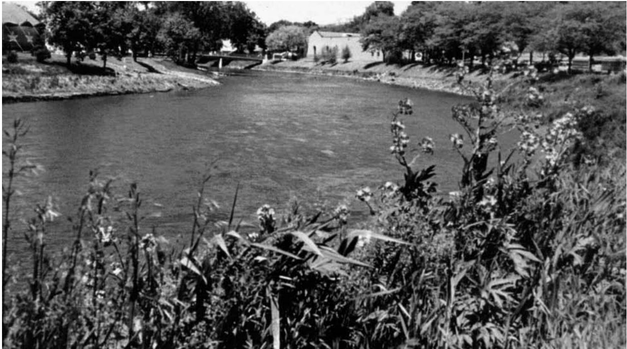
Baraboo River in Wisconsin after the Waterworks Dam removal.

owner against liabilities associated with dam ownership. However, dam removal also comes with costs, including funds spent on removing the dam and, if necessary, replacing its uses.