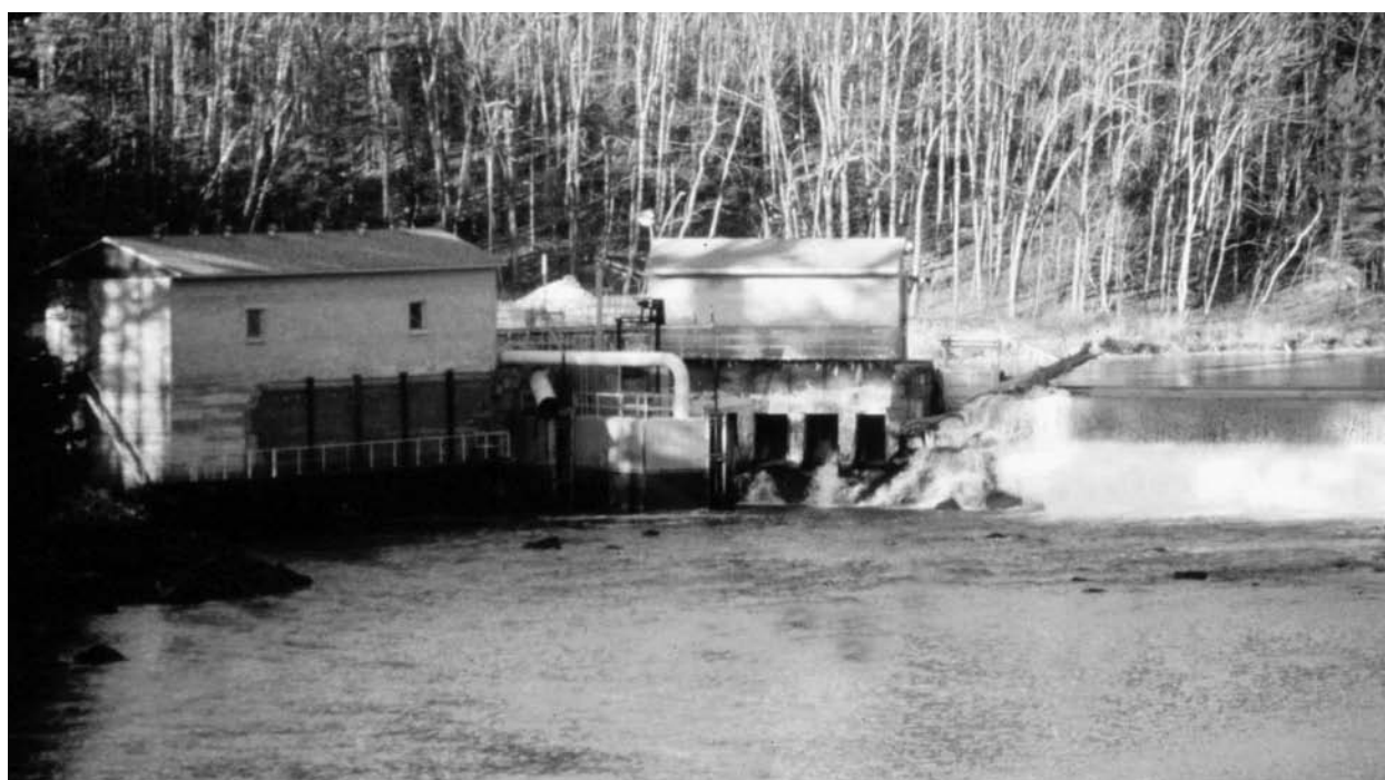
Smelt Hill Dam on the Presumpscot River in Maine.

mine the best option. Exploring Dam Removal helps to ensure that a full range of costs and benefits are identified. Obtaining the answers to the questions identified here and in the Appendixes will enable a more complete analysis of the options of keeping or removing a dam and can have an impact on the cost and ultimate feasibility of either decision. Working through the many issues involved in deciding to keep or remove a dam can offer surprising conclusions that can lead to a reasoned approach – reducing subjectivity and increasing objectivity.