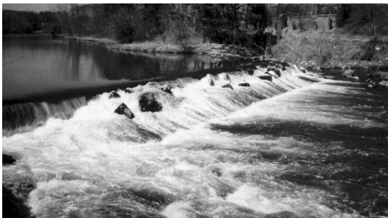
Union Dam on the Naugatuck River in Connecticut prior to removal.

riparian lands can be restored, with potential benefits for native fish, birds, plants, insects, and other wildlife. Following the removal of smaller dams, there may only be a modest amount of newly exposed lands. For dams with larger impoundments, the exposed upland could be extensive. When large impoundments are removed, the actual footage of the riparian zone may be reduced due to transformation of a wide impoundment into a narrower river, but the quality of riparian habitat will be increased due to its association with riverine instead of lacustrine-like waters.