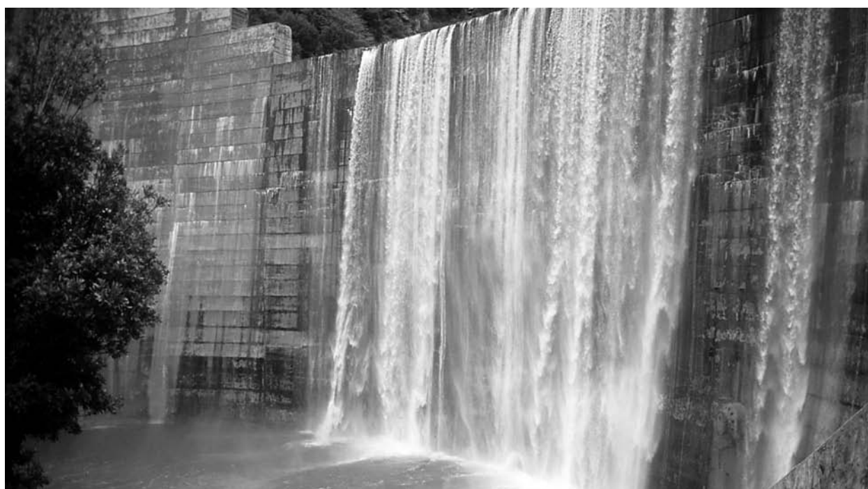
Matilija Dam on the Ventura River in California.

Several state and federal agencies have personnel qualified to help answer questions about dam removal and stream restoration. These agencies include: