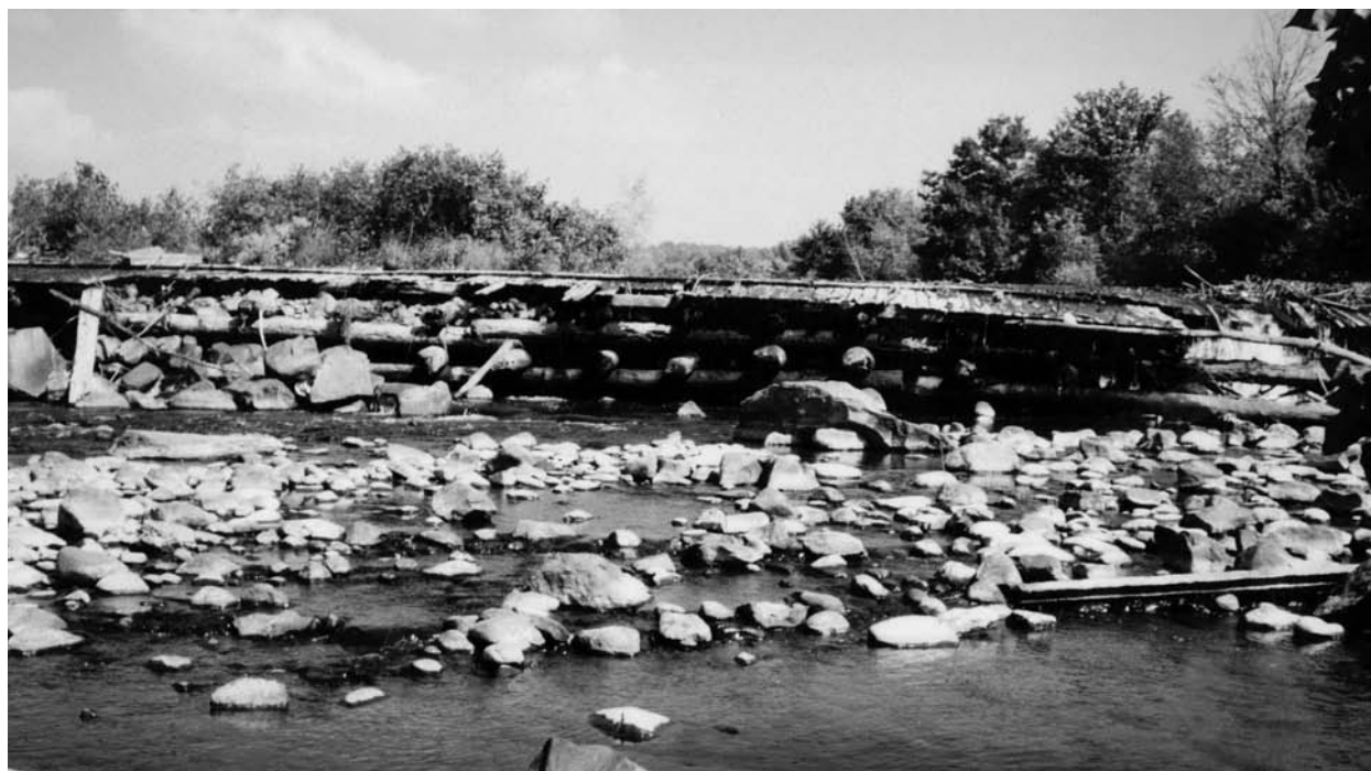
Anaconda Dam on the Naugatuck River in Connecticut.