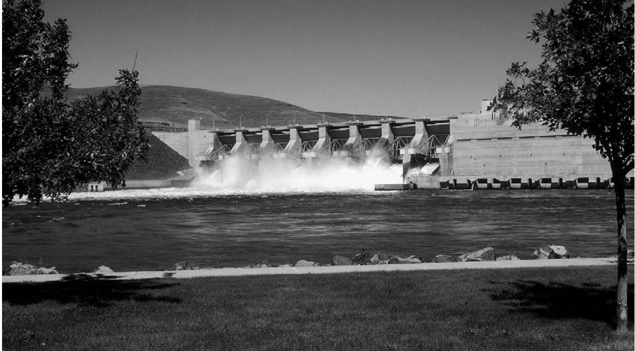
Little Goose Dam on the Snake River.

potential for fish passage or removal at other dams is also important in understanding the impact of the dam and dam removal on fish movement in the basin.