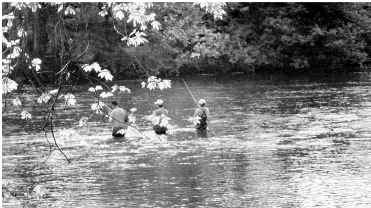
Conodoguinet Creek in Pennsylvania after the Good Hope Dam removal.