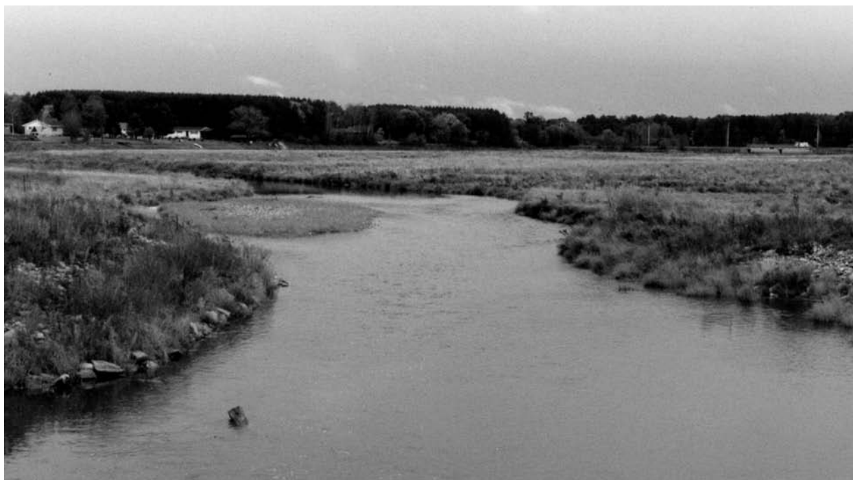
Prairie River in Wisconsin after the Ward Paper Mill Dam removal.

The results of dam removal may also have an impact on other dams downstream due to changes in flows and dispersal of sediment. Depending on the proximity of downstream dams and their capacity to handle such changes, the design of the dam removal may have to be altered to lessen the impacts.