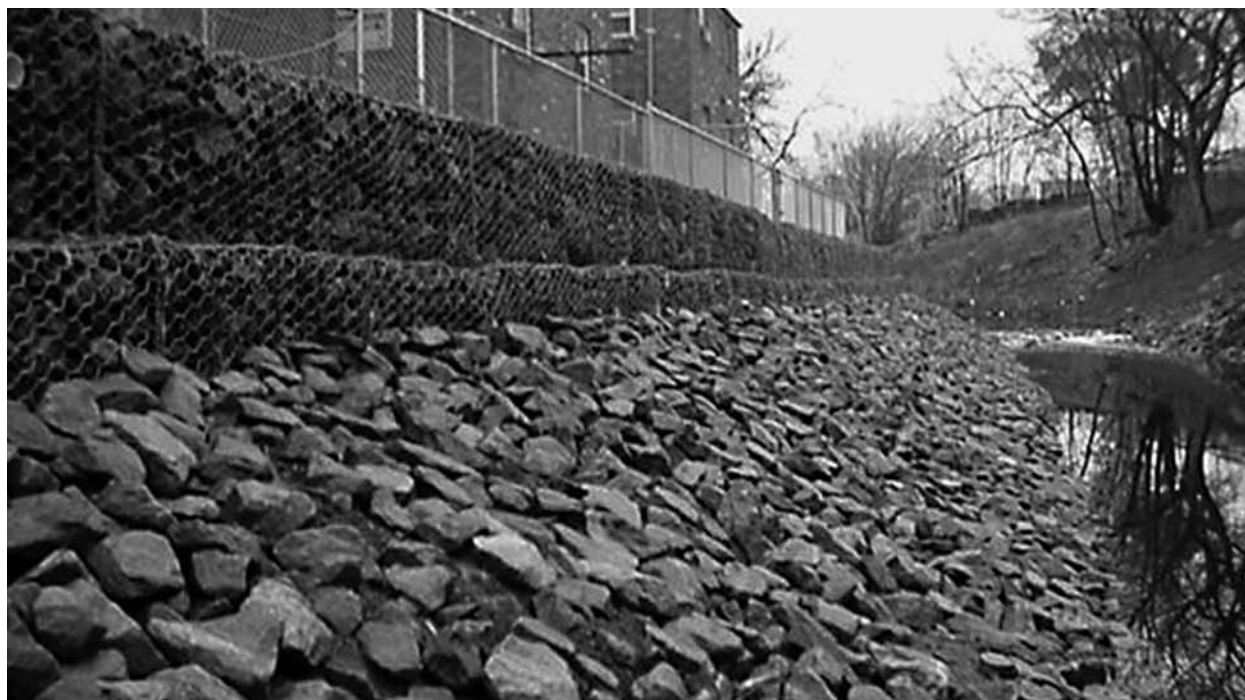
Example of a poor river bank stabilization.