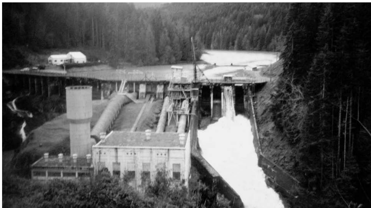
Elwha Dam on the Elwha River in Washington State.