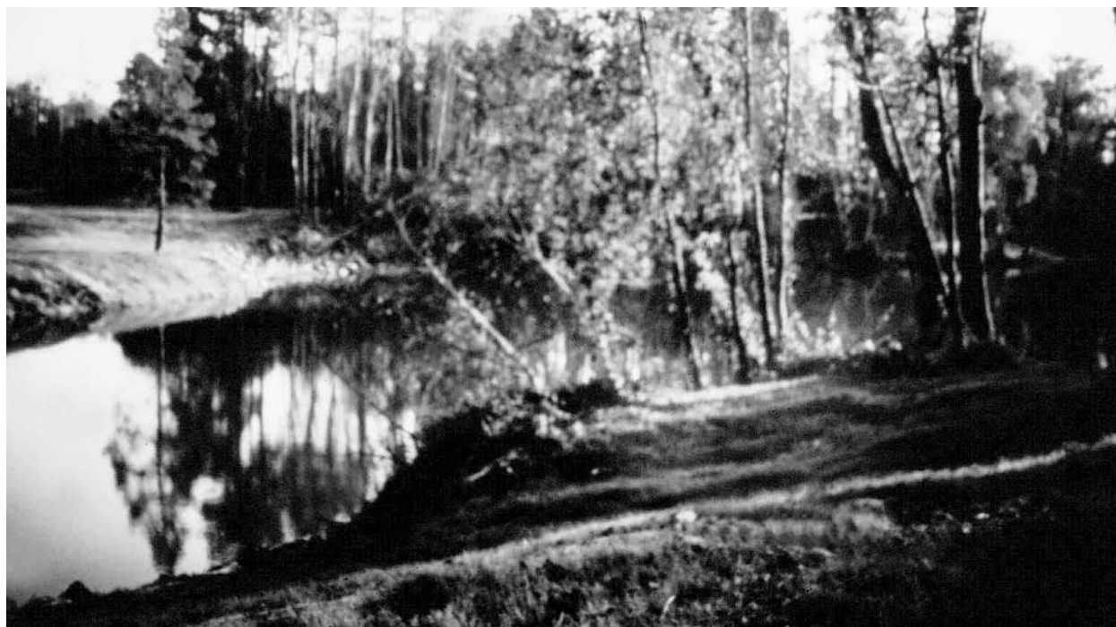
Neuse River in North Carolina after the Quaker Neck Dam removal.