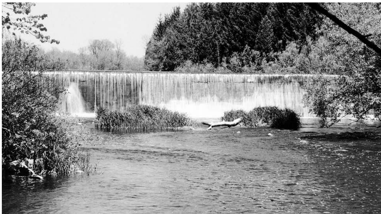
Franklin Dam on the Sheboygan River in Wisconsin.

concerns. In some cases the regulatory process can play a significant role in determining restoration or repair options and costs.