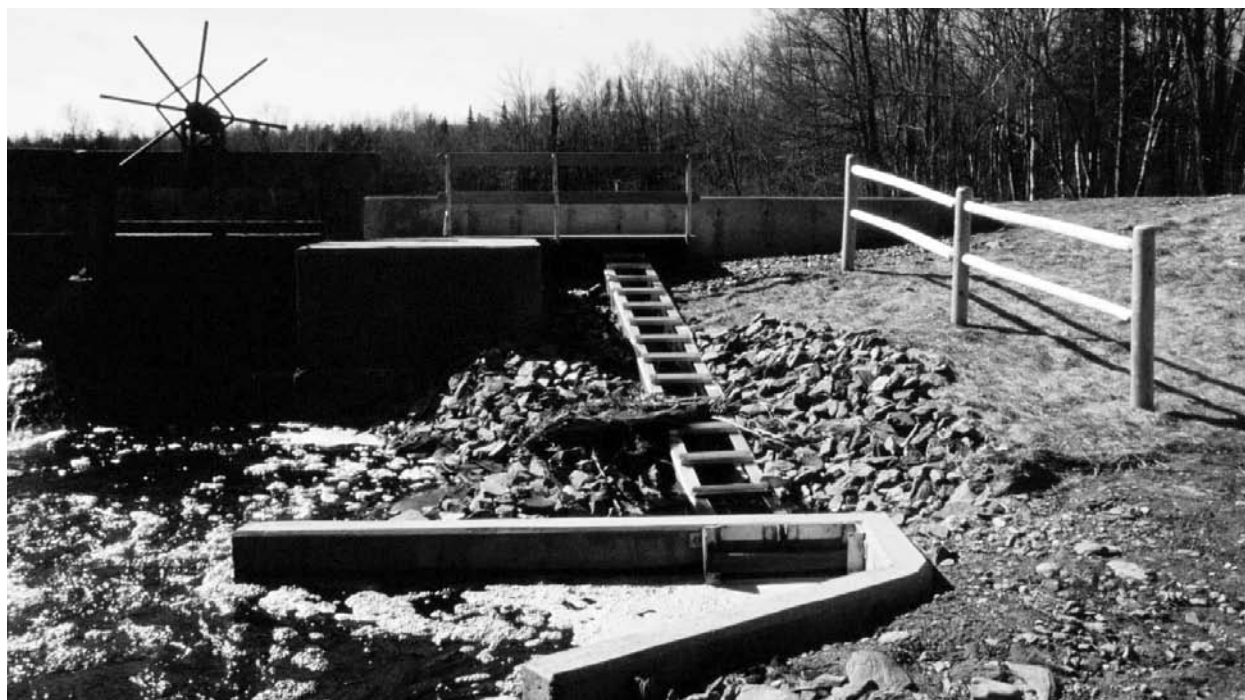
Denil fish ladder at dam on Pleasant Lake in Stetson, Maine.

the habitat in the impoundment and the presence of other lakes, reservoirs, or wetlands nearby, this loss may or may not be significant. Further, the process of removing a dam may temporarily disrupt habitat for species sensitive to changes in water quality and water level. However, taking certain precautions in the timing and design of the removal may minimize this impact. 9