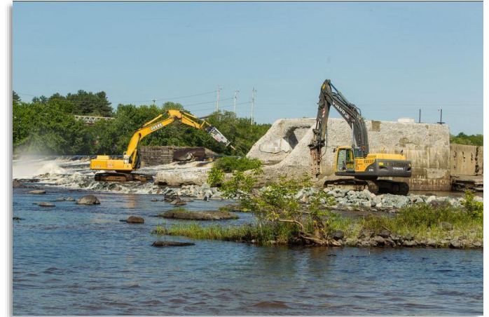
Veazie Dam Removal: Credit Penobscot River Restoration Trust