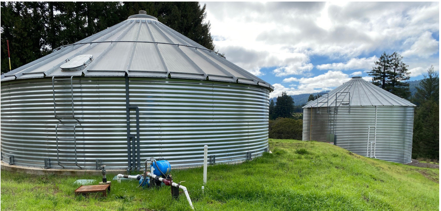
Figure 1. 39K-gallon rainwater catchment tank on the left with a 63K-gallon tank on the right, to capture and store water in the wet season.

The Navarro Streamflow Enhancement Partnership – a team of nonprofit and local government organizations including Mendocino County Resource Conservation District (MCRCD), The Nature Conservancy, and Trout Unlimited – worked together to see the project through to completion. MCRCD spearheaded the project, securing grant funds, coordinating the tank system design, and managing implementation. Completed in 2021 and funded by a combination of public grants, project partners installed a 63,000-gallon tank filled with winter stream flow and a 39,000-gallon rainwater catchment tank filled by runoff from a barn roof. Importantly, the Partnership helped Blue Meadow get a new water right to replace their riparian right, which