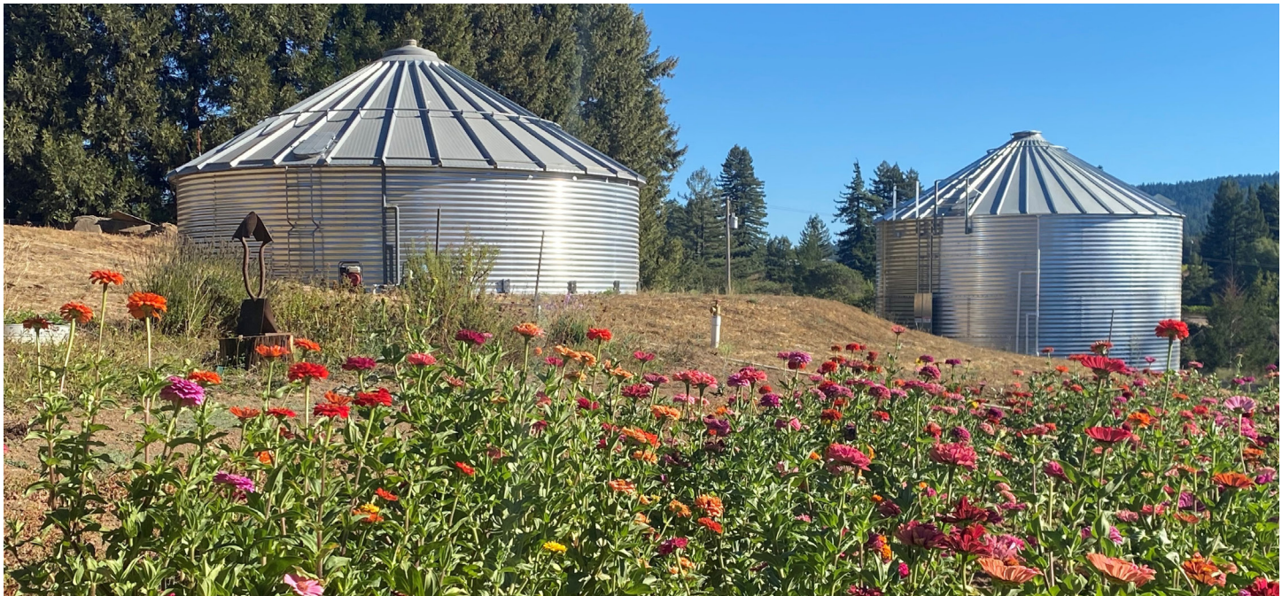
Above right: Figure 2. Signs help keep the community up to date on streamflow conditions and the life cycles of salmonids.