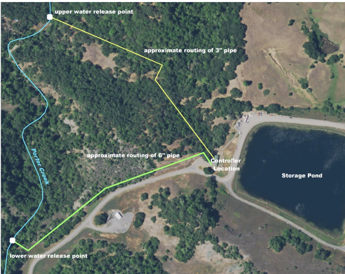
Figure 4. Schematic of approximate locations of pipe and water release points to Porter Creek from the E & J Gallo storage pond.