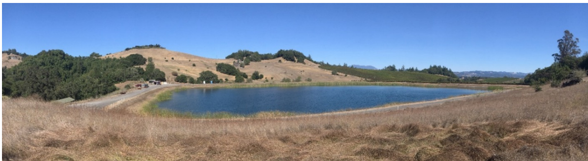
Figure 3. 250-acre foot storage pond on the E & J Gallo MacMurray Ranch property that supplies water to the Porter Creek flow augmentation system.